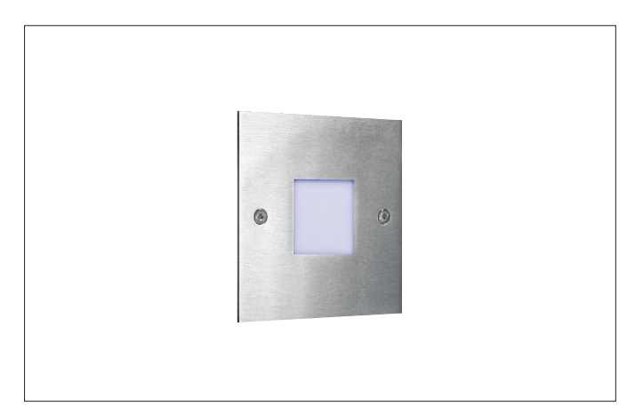
Light. For Generations.