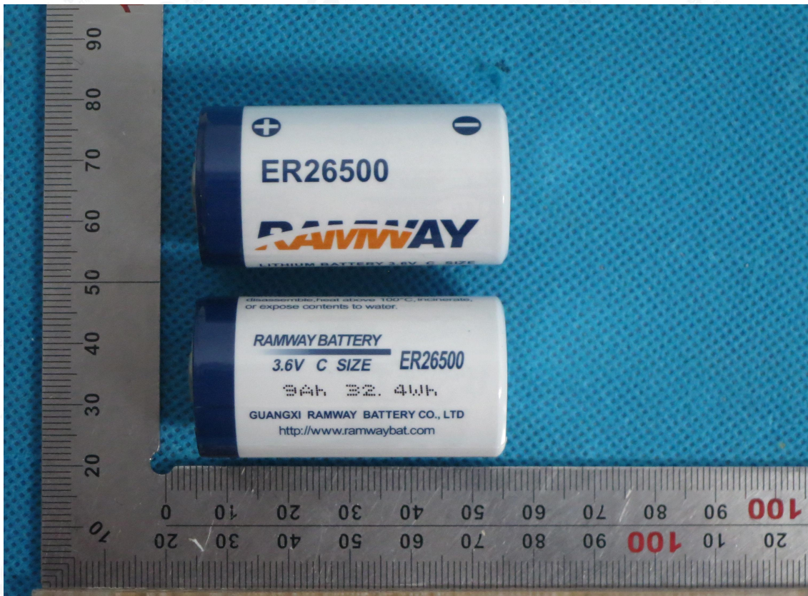
鑫宇环仅对原报告照片中的样品负责 AGC authenticate the photo on original report only

The results shown in this test report refer only to the sample(s) tested unless otherwise stated and the sample(s) are retained for 30 days only. The document is issued by AGC, this document cannot be reproduced except in full with our prior written permission. The document is available on request and the brief information for its validation can be assessable and confirmed at http://www.agc-cert.com