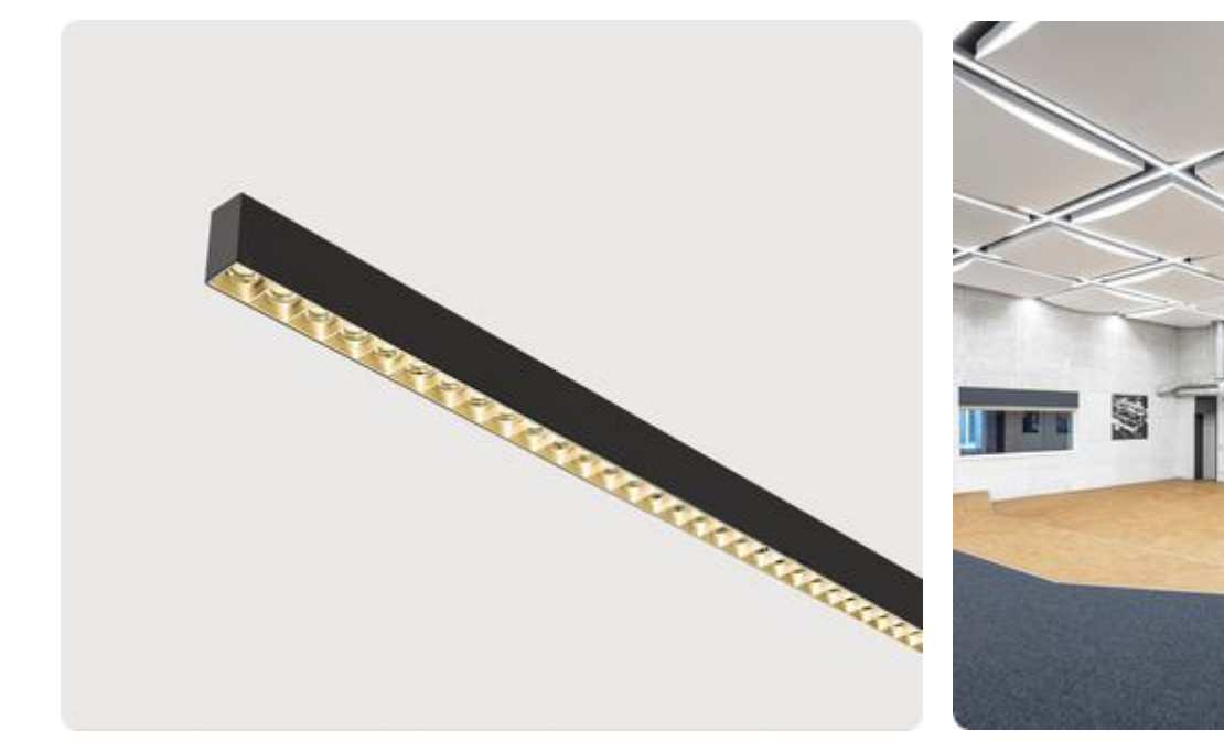
Illustrations may only be similar and serve as an orientation.

Matric-A3. LED. Wall or ceiling mounted light-line. Luminaire body made of high-quality aluminum profile. Surface finish Jet Black. Direct only light distribution. Colour temperature: 3000(Warm White). Colour Rendering Index (CRI): >80. Lens Louvre: precision lenses with louvre. High glare limitation, compatible for office applications. Reflector: Satin Gold. Dimmable DALI. LxWxH (rectangular). L= 2002mm. W=55mm.