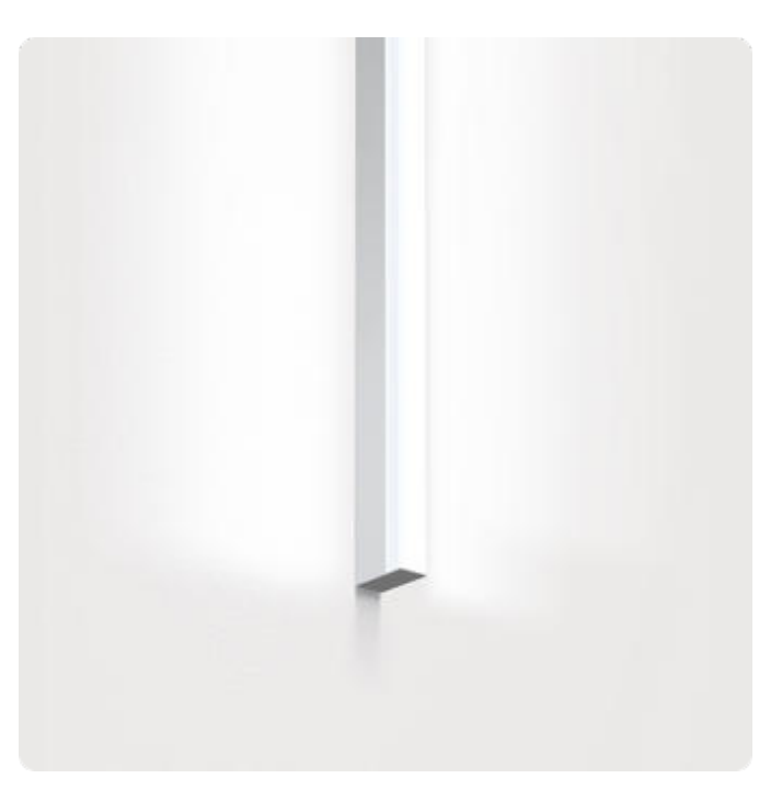
Illustrations may only be similar and serve as an orientation.

Matric-AX. LED. Wall or ceiling mounted light-line. Luminaire body made of high-quality aluminum profile. Surface finish Silver Anodised. Direct only light distribution.Colour temperature: 4000K (Cool White). Colour Rendering Index (CRI): >80. Ambient diffuser made of frosted methacrylate for enhanced light transmission and perfect uniform illumination. Dimmable DALI. LxWxH (rectangular). L=890mm. W=40mm. H=65mm. High-power current.