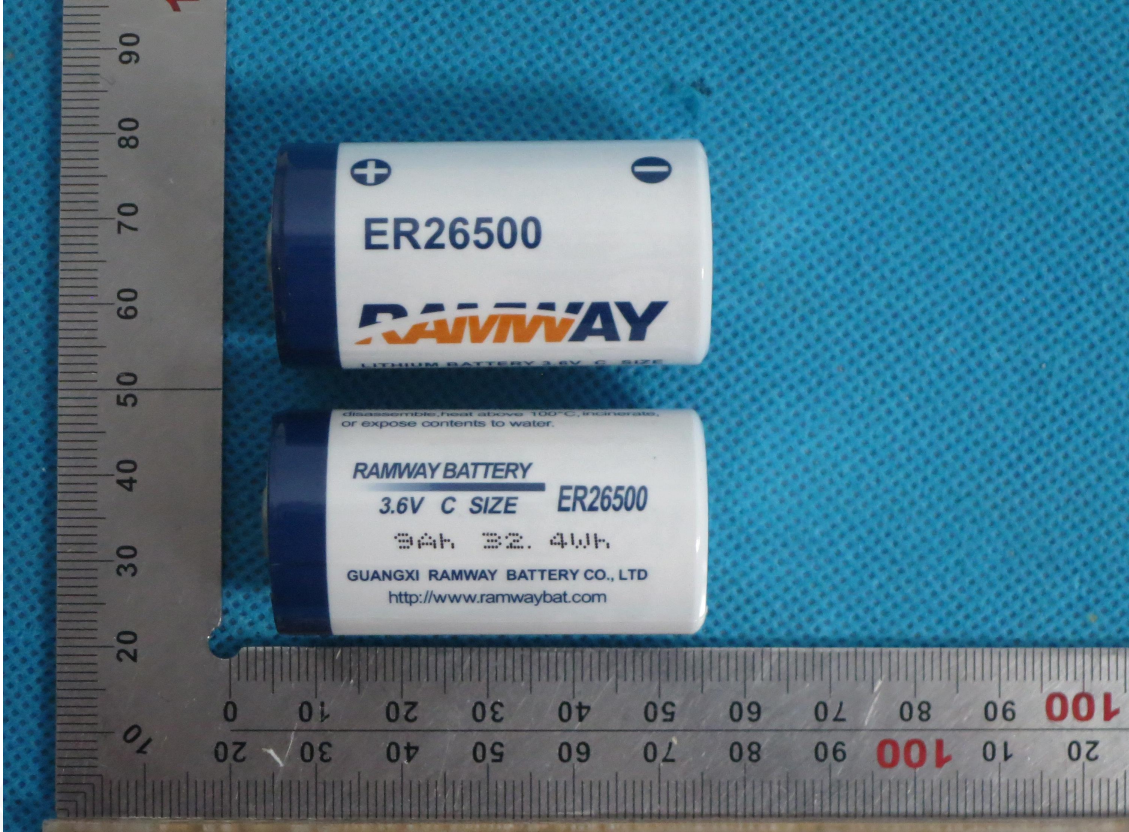
鑫宇环仅对原报告照片中的样品负责 AGC authenticate the photo on original report only

The results shown in this test report refer only to the sample(s) tested unless otherwise stated and the sample(s) are retained for 30 days only. The document is issued by AGC, this document cannot be reproduced except in full with our prior written permission. The document is available on request and the brief information for its validation can be assessable and confirmed at http://www.agc-cert.com