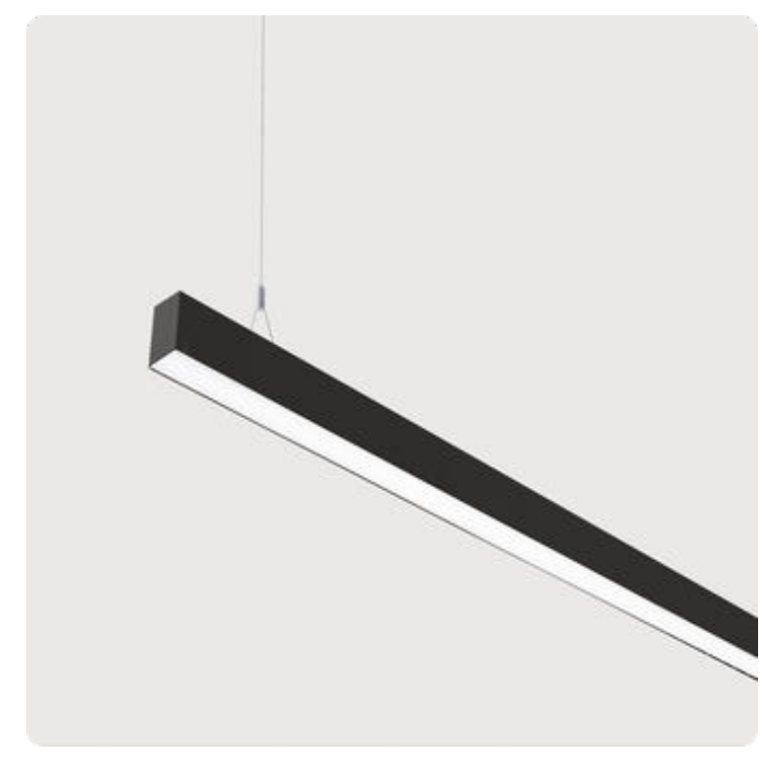
Illustrations may only be similar and serve as an orientation.

Pendant light-line - Direct/indirect light distribution