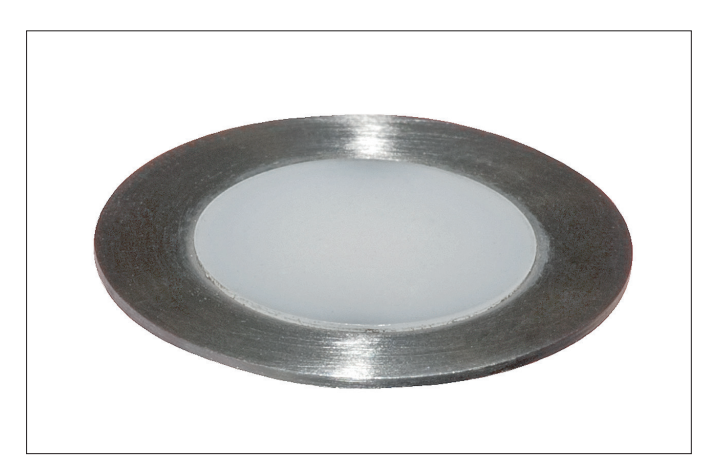
Light. For Generations.