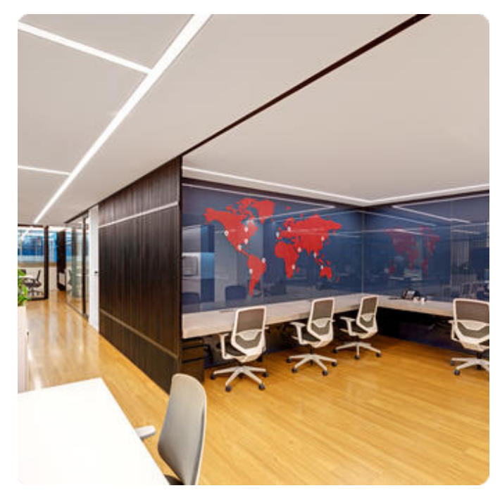
Illustrations may only be similar and serve as an orientation.

Matric-F3. LED. Recessed mounted light line with surrounding frame for installation in sawn wall and ceiling with cut-out openings. Mounting brackets included. Luminaire body made of high-quality aluminum profile. Surface finish Silver Anodised. Direct only light distribution. Colour temperature: 4000K (Cool White). Colour Rendering Index (CRI): >80. Opal diffuser for enhanced light transmission and perfect uniform illumination. Switchable. LxWxH (rectangular). L=905mm. W=70mm. H=75mm.