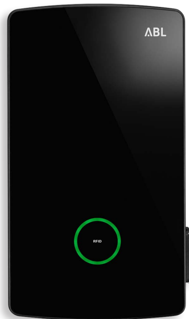
Product number 100000158

The robust design and high-quality workmanship of the Wallbox eM4 Single protect it from external influences. The wallbox comes pre-installed and ready for connection thanks to an integrated Type A RCCB and DC residual current detection. All ABL wallboxes are made in Germany and comply with the highest safety standards.