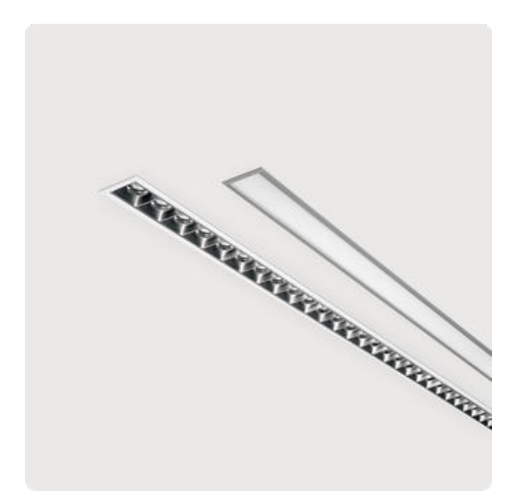
Illustrations may only be similar and serve as an orientation.

Matric-F3. LED. Recessed mounted light line with surrounding frame for installation in sawn wall and ceiling with cut-out openings. Mounting brackets included. Luminaire body made of high-quality aluminum profile. Surface finish Silver Anodised. Direct only light distribution.Colour temperature: 4000K (Cool White). Colour Rendering Index (CRI): >80. Lens Louvre: precision lenses with louvre. High glare limitation, compatible for office applications. UGR<=19. Reflector: Satin Silver. Switchable. LxWxH