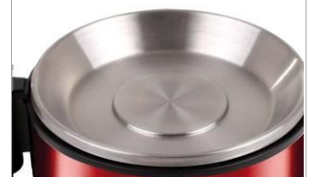
Easy-care stainless steel heating bowl