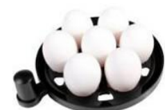
For 1 – 7 eggs