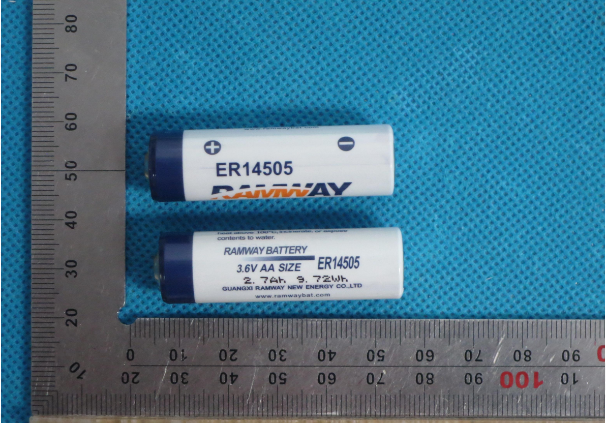
鑫宇环仅对原报告照片中的样品负责 AGC authenticate the photo on original report only

The results shown in this test report refer only to the sample(s) tested unless otherwise stated and the sample(s) are retained for 30 days only. The document is issued by AGC, this document cannot be reproduced except in full with our prior written permission. The document is available on request and the brief information for its validation can be assessed and confirmed at http://www.agc-cert.com