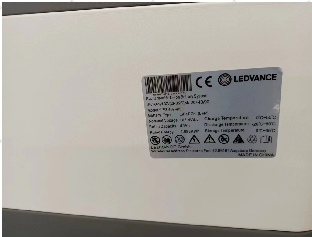
Figure 4 Battery Label (标签图)