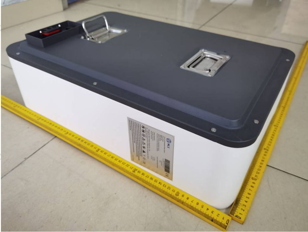
Figure 1 Overall view I of battery (外观图I)