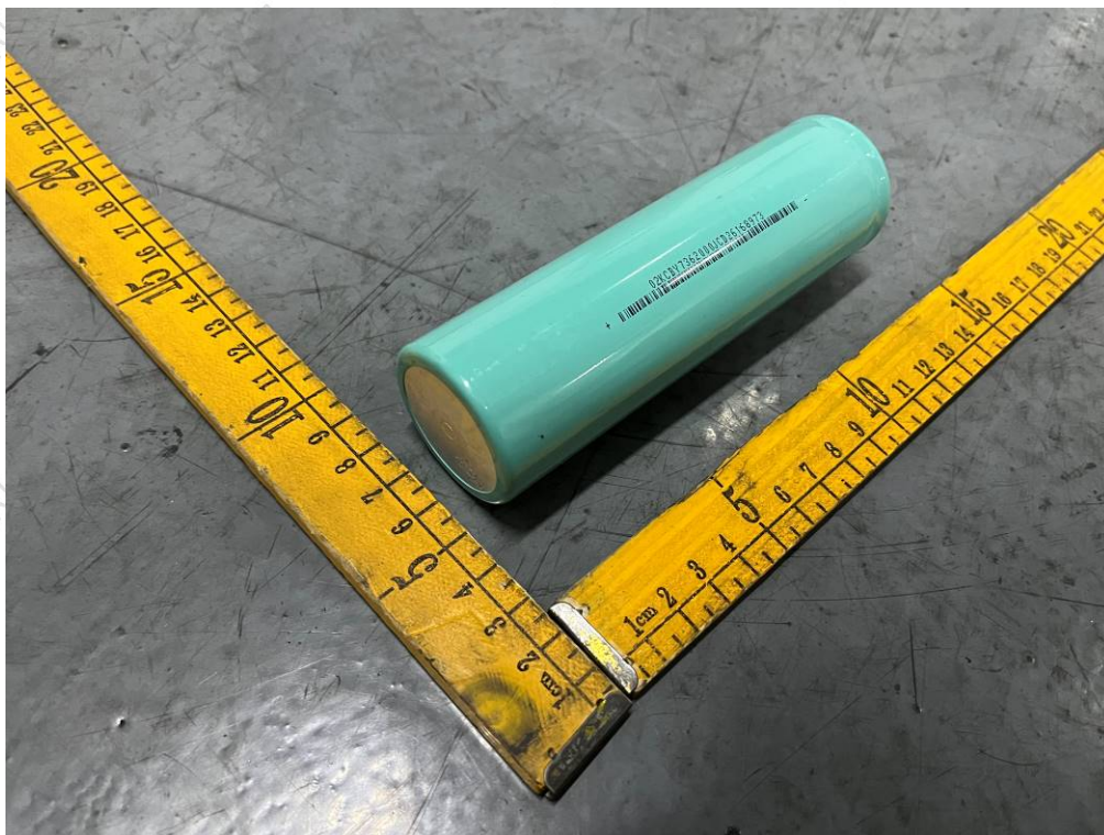
Figure 3 Overall view of cell (电芯图)