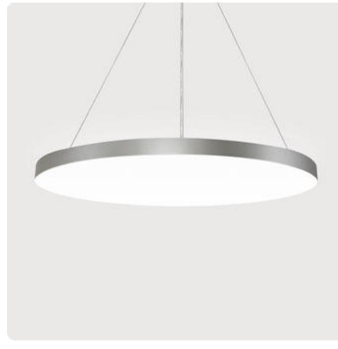
Illustrations may only be similar and serve as an orientation.

Pendant luminaire - Direct light distribution